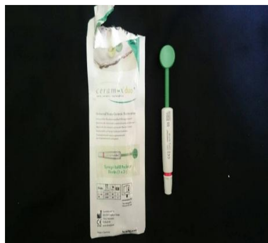
Komposit Nano hybrid (duo Ceramic)