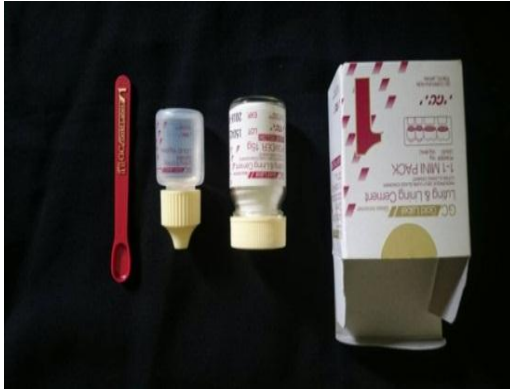
Semen ionomer kaca tipe 1 Tipe 1