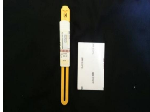
Self adhesif semen Rely X U200