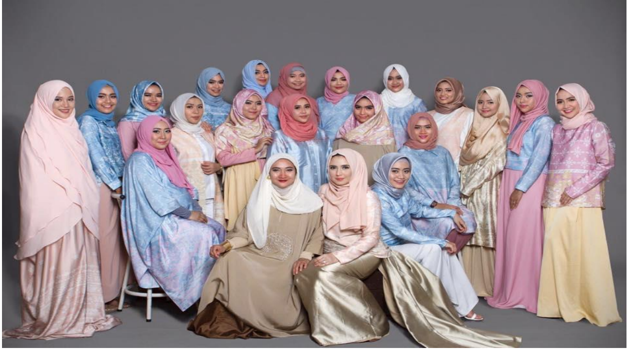
Foto Anggota dan Kegiatan HCY