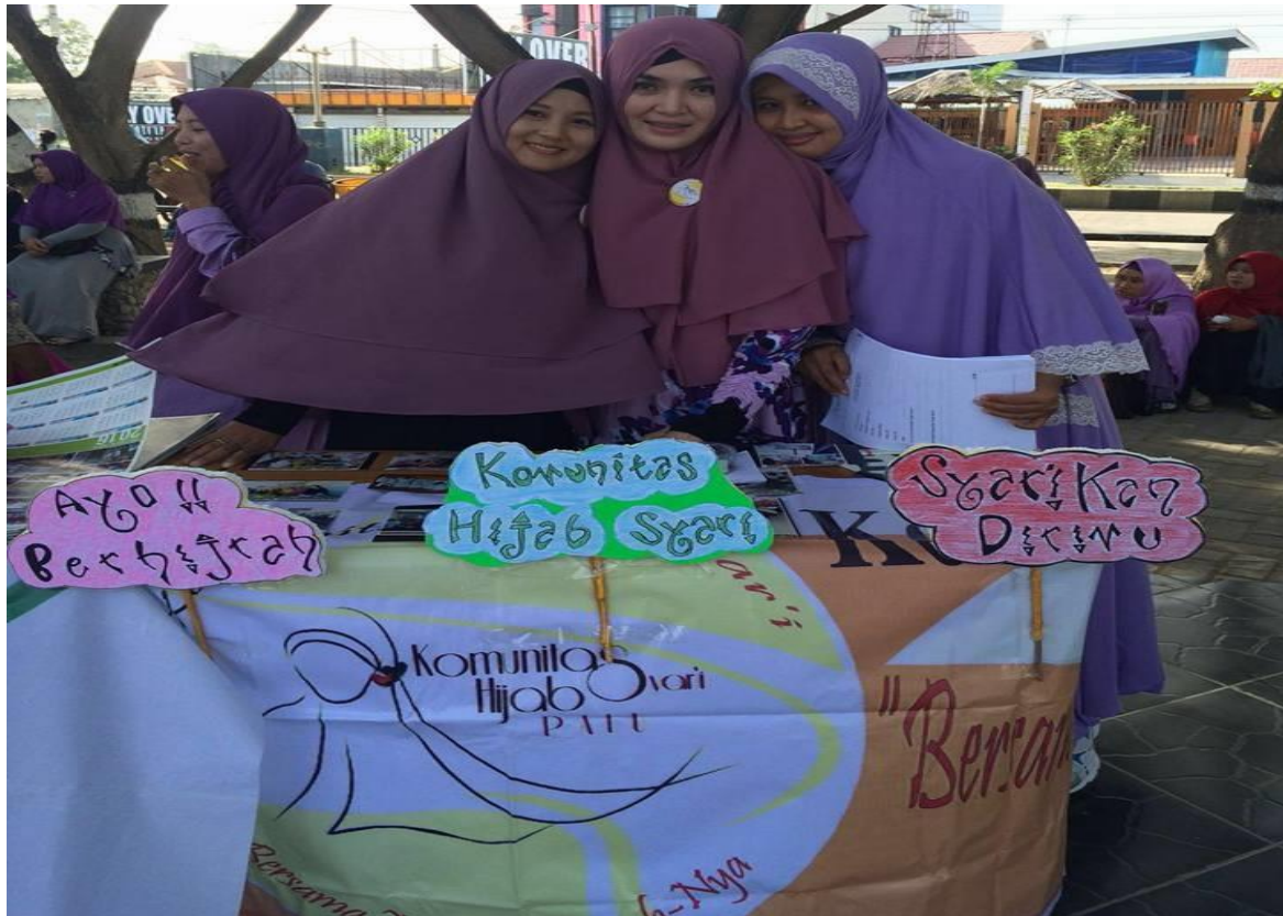
( http://www.metrosulawesi.com/article/anggota-komunitas-hijab-palu-terus-bertambah )