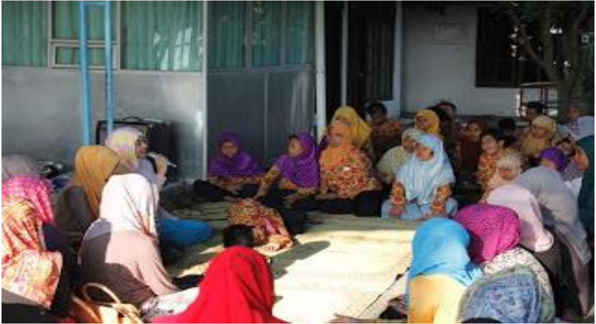
(Bakti Sosial - Panti Bina Siwi Bantul)