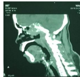
Fig. 4. Superiorly infiltrating intracranially through the cavernous sinus.