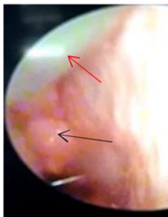
Fig. 2. Polyp in Right Nasal Cavity (red arrow) and Nasopharyngeal Mass (black arrow)