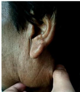
Fig. 1. Mass at Level III (Upper Jugular) of Left Neck Region

results were polyp nasi Hellquist Type I and Undifferentiated Nonkeratinizing Carcinoma. CT with contrast showed the nasopharyngeal mass has extended intracranially. Patient was diagnosed as chronic rhinosinusitis with nasal polyp and nasopharyngeal carcinoma stage IVA.