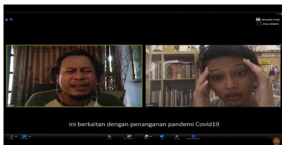
Fig. 3. Online Meeting To Lock The Picture (Mamad, 2020)

Similarly, the stage of pre-production and post-production were designed to minimize direct meetings for the crew involved. Pre-production Meeting (PPM), picture lock, and preview were conducted online by using email and communication applications, such as Google Duo and Zoom Akhmad Fesdi Anggoro (Piknik, 2020) as the editor said that the production project is done without direct meeting with the direction.