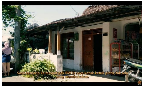
Fig. 5. Frame in Mundur ( Mundur , 2020)

becomes the concept of Mantan . The voice from the application is also used to narrate dialog, which its visual was in the form of chatting text.