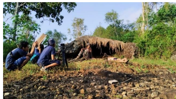
Fig. 7 Behind the Scene Sawan (Riyanto, 2020)

The equipment used for the shooting process is Digital Single-Lens Reflex (DSLR) camera. The consideration is the practicability in the shooting process, final quality, and flexibility in post-production. The understanding of the final specification targeted related to screening space is the main thing in the technical planning of production. Through this consideration, Riyanto chose a cell phone to record his film. The management of production work shows the relation between economics and aesthetics.