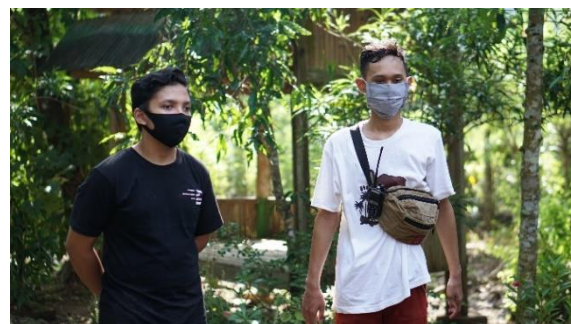
Fig. 2. Film Production Crews on Location (Elena, 2020)

In the production stage, the pattern implemented related to the number of workers is the limitation of works involved. This attempt is not only for cost but also to follow the health protocol in film production. Health protocol was applied to the crew involved as appearing in the documentation of film production of Gladi Resik.