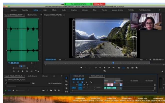
Fig. 6. Shot in Mantan ( Mantan , 2020)

The equipment used for the shooting process is Digital Single-Lens Reflex (DSLR) camera. The consideration is the practicability in the shooting process, final quality, and flexibility in post-production. The understanding of the final specification targeted related to screening space is the main thing in the technical planning of production. Through this consideration, Riyanto chose a cell phone to record his film. The management of production work shows the relation between economics and aesthetics.