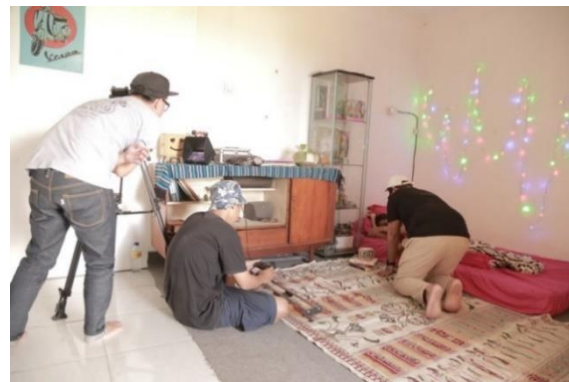
Fig. 1. Bedroom Setting (Fajar, 2020)

Location selection is also a substantial consideration in film production. The smoothness of production is determined by the challenges that occurred in the location. Locations selected by the directors mostly were their neighborhoods for efficiency and obeying the government's encouragement, namely, to stay productive at home. Riyanto, on the other hand, chose the forest as the location as it is free from human activities. Coincidentally, his home is close to the forest. In addition, the number of locations can also be made efficient by only using one set, as in Oski Oska (Fajar M.S., 2020).