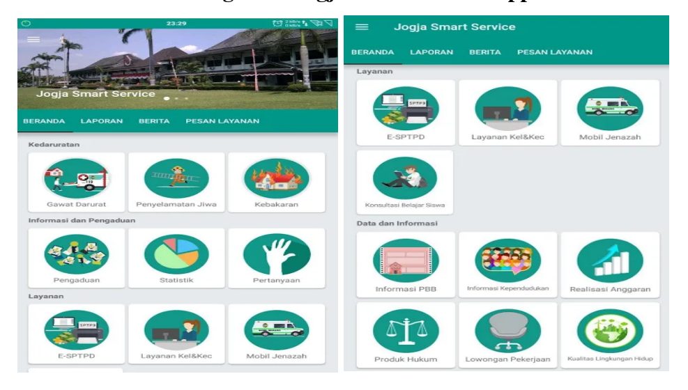
Figure 2. Jogja Smart Service Application

the different between Jogja Smart Services and other applications, and the usage place for Jogja Smart Service Application.