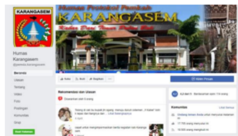
Figure 2: @HumasKarangasem Fanspage