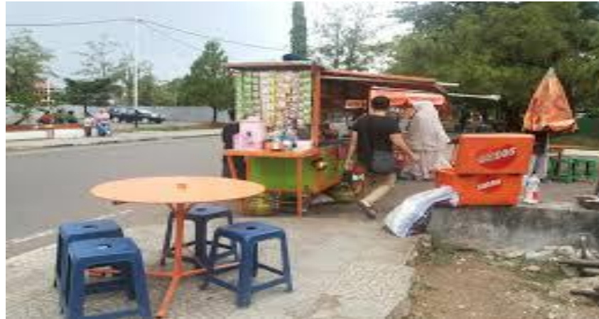
Street vendors at Murjani Field