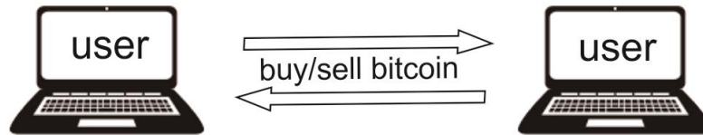
Picture. 4.2 Transaction of Bitcoin after the Existence of Bitcoin Trading Company