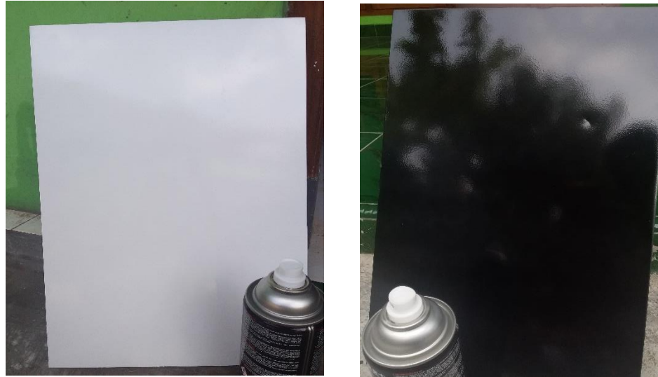
Gambar 1.1 Proses Pelapisan permukaan Dengan Epoxy, cat, dan Clear Coat