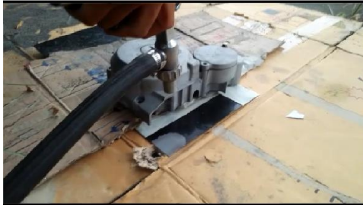
Gambar 1.4 Hasil Sandblasting