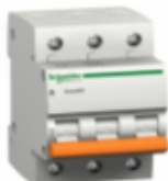
MCB Domae 3 Kutub