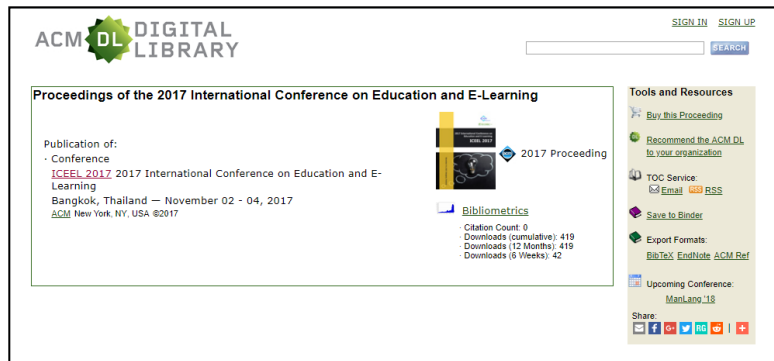
Gambar 5 Proceeding ICEEL 2017