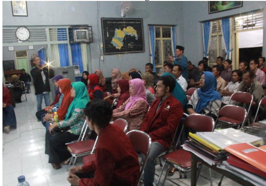
Figure 3.2 Socialization and Training Tourism Potentials