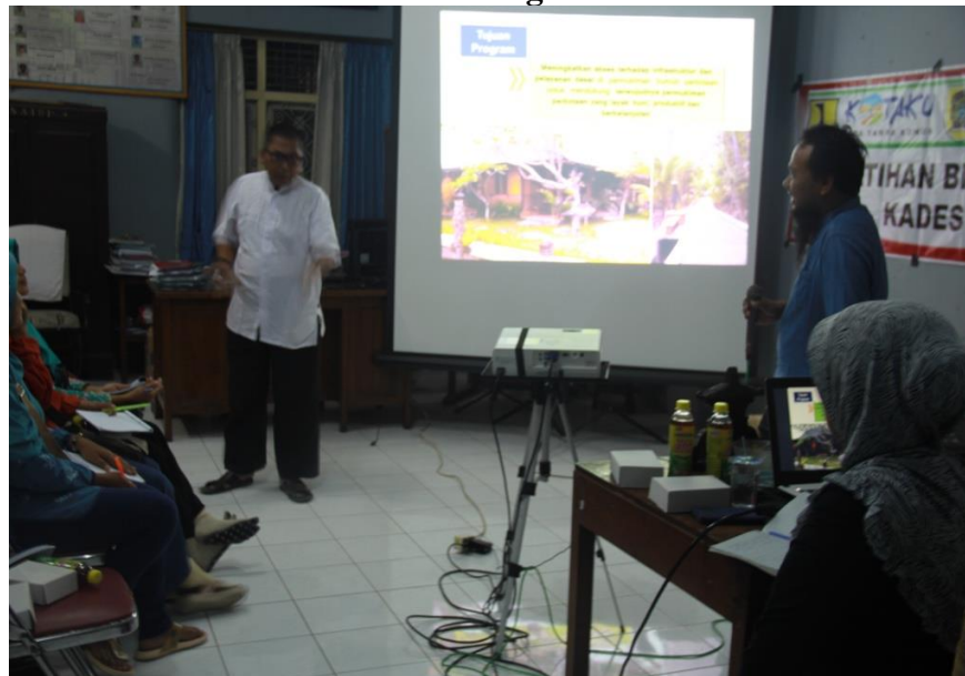
Figure 3.1 Socialization and Training Tourism Potentials

From the explanation above, it can be concluded that the initial conditions for collaboration between village government and Java Reconstruction Fund are from the community and village government who innovate to make Candirejo village a tourist village which can later improve the economy in Candirejo Village.