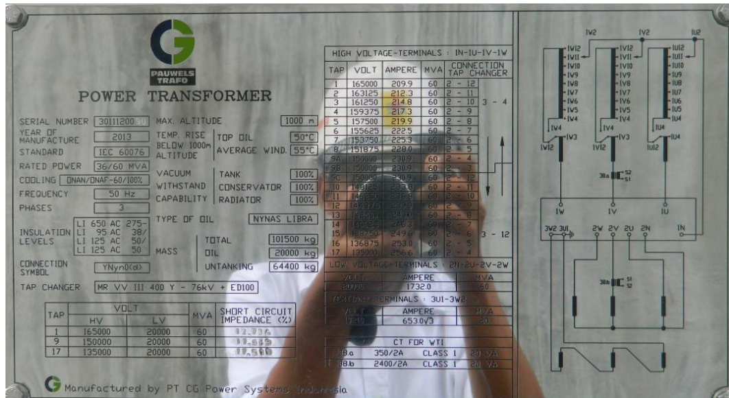
Spesifikasi Transformator 2