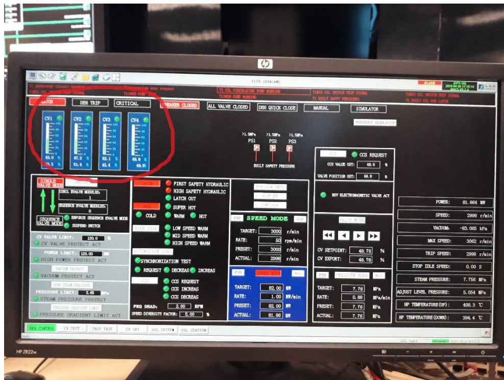
Gambar 5.5 Tampilan Governor Pada Monitor