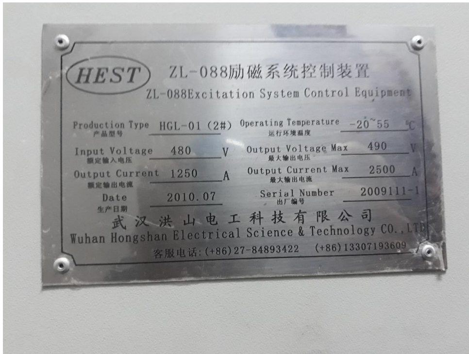
Gambar 5.3 Spesifikasi Sistem Kontrol Eksitasi