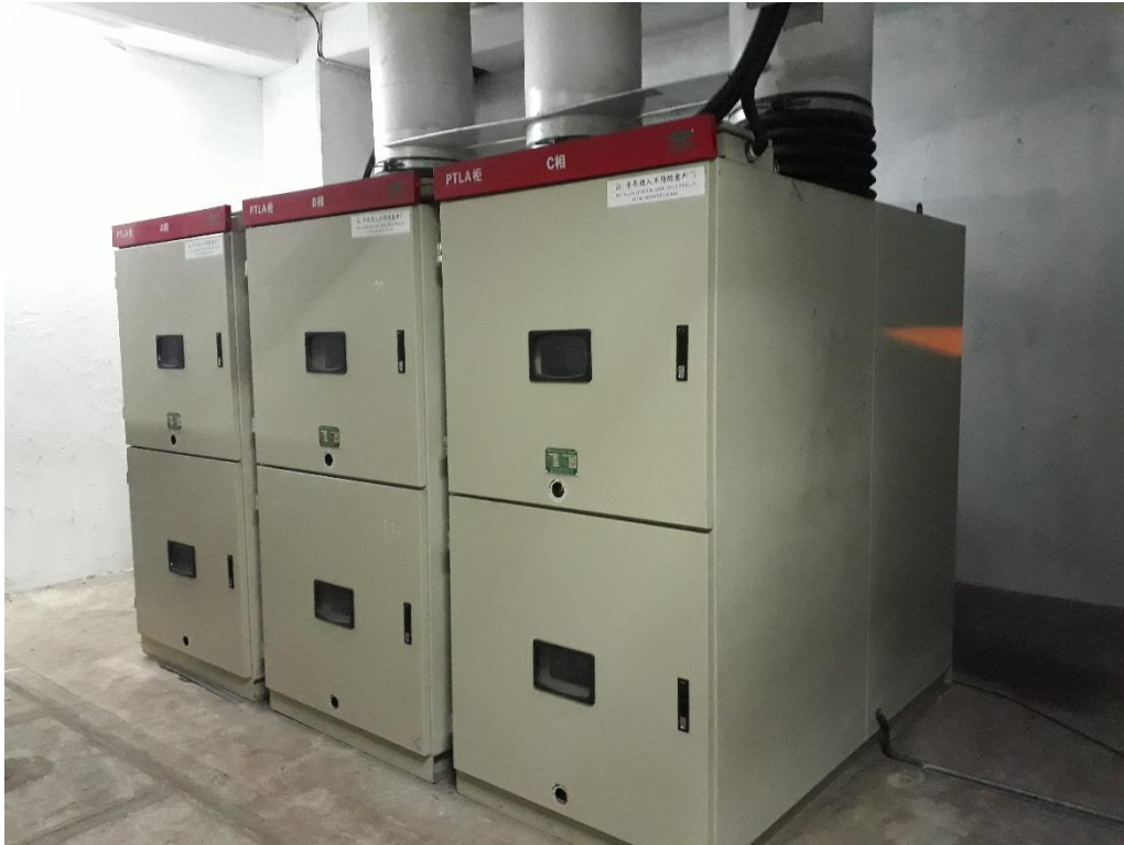
Gambar 5.7 Excitation Transformer