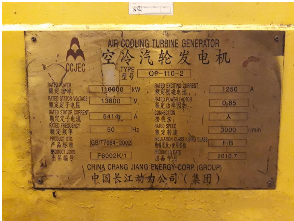
Gambar 5.6 Spesifikasi Generator QF-110-2