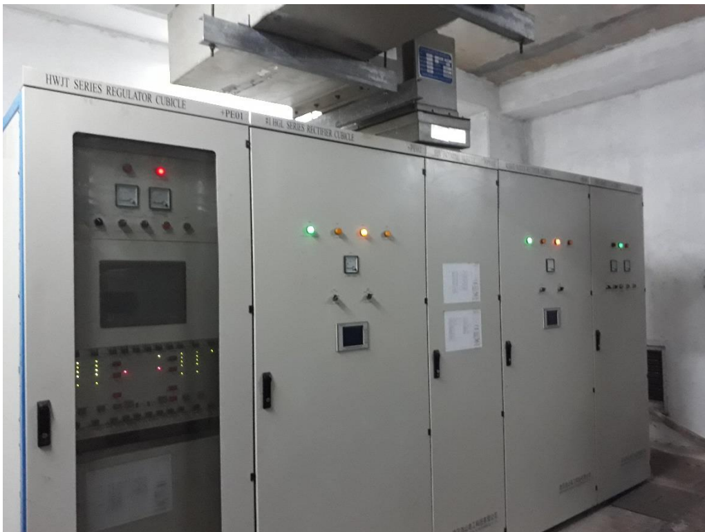
Gambar 5.8 Cubicle System Excitation