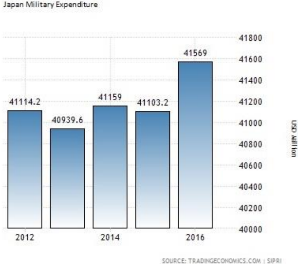
Picture 1 Diagram of Military Budget Data

power, particularly in the change of military policy, which is the increasing of the Japanese military budget which surpasses the 1% of GDP due to the expansion of military capability. The Japanese military budget is significantly increased since Shinzo Abe's cabinet approved a record of the military budget (Telesur, 2015).