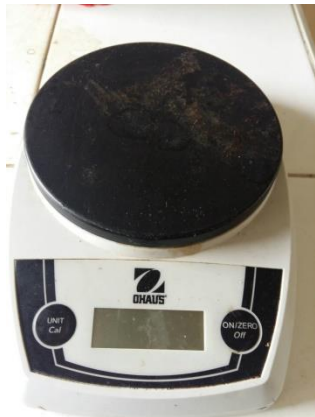
Gbr 9. Timbangan