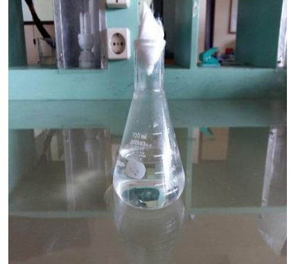
gbr 3. Akuades