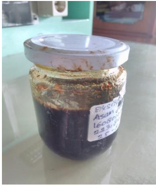
Gbr 1. Ekstrak buah Asam Jawa