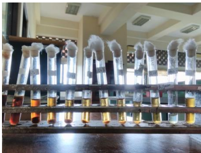
Gbr 16. Hasil dilusi cair