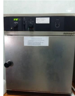
Gbr 8. autoclaf