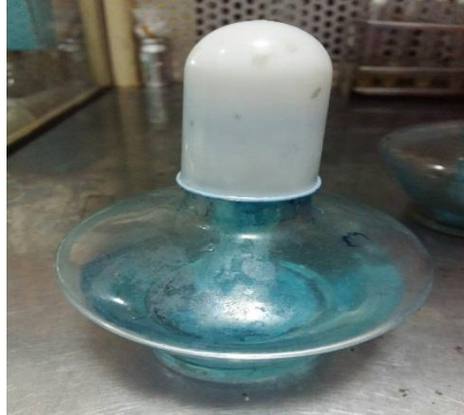
Gbr 2. spiritus