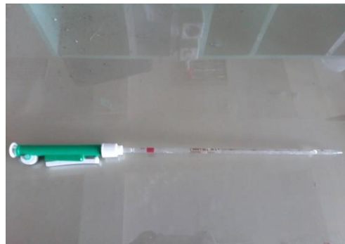
Gbr 5. Pipet ukur 1 ml