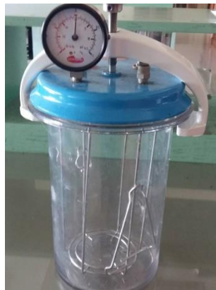
Gbr 10. anaerobic jar