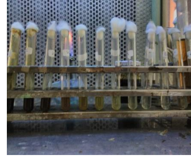
Gbr 14. sebelum inkubasi