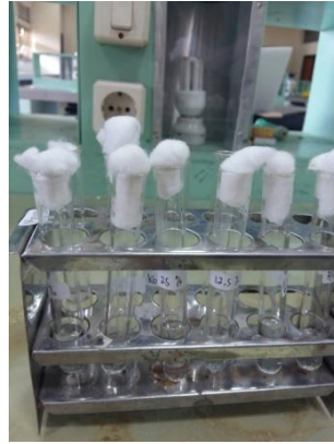
Gbr 13. Aquades 1 ml