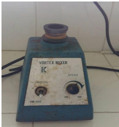
gbr 4. Vortex