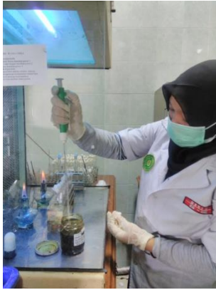
Gbr 12. Proses penelitian