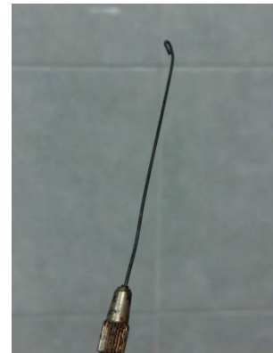
Gbr 11. Ose steril