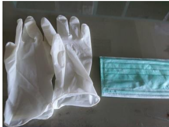
Gbr 6. Glove dan masker