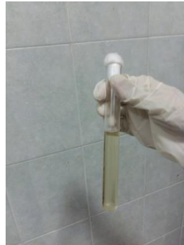
Gbr 7. BHI cair