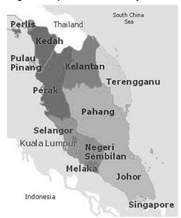
Which is Located Selangor and Johor

(Statistical Package Social Sciences) program version 21.0 used to analyze quantitative data that was collected from respondent at the field survey. After all the data had been entered, a frequency output, mean and standard deviation for all variable was undertaken to check that the data had been correctly entered and to identify any missing data and outliers. Few statistical analyses were obtained to analyze the data such as descriptive analysis and chi-square analysis. The descriptive analysis was used to analyzed socio-demographics and farm profile of farmers. Finally, chi-square analysis used to describe a set of association between socio-demographic characteristics with pineapple farmer's knowledge, skills and practices in Malaysia.