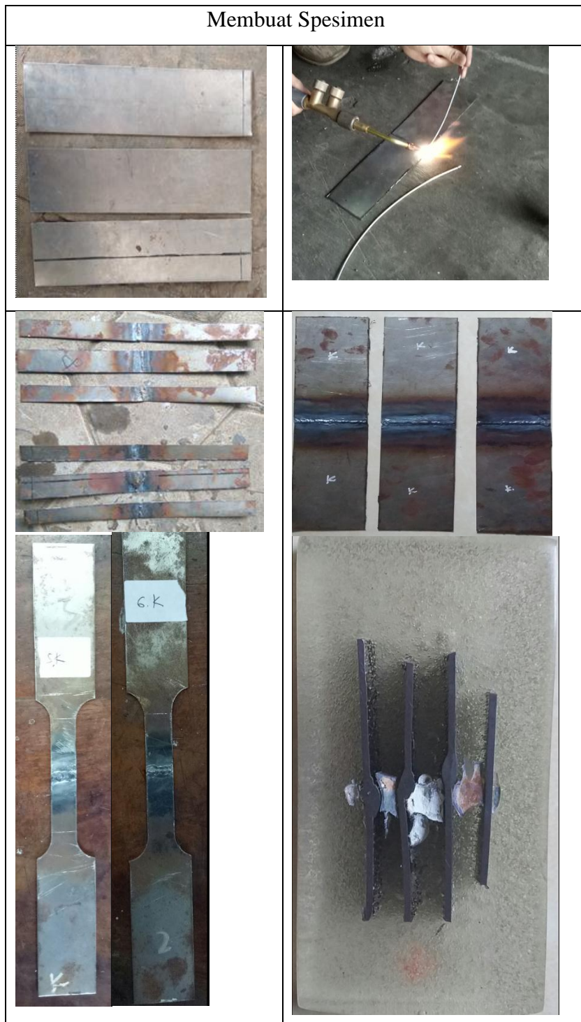
Tabel 1 spesimen